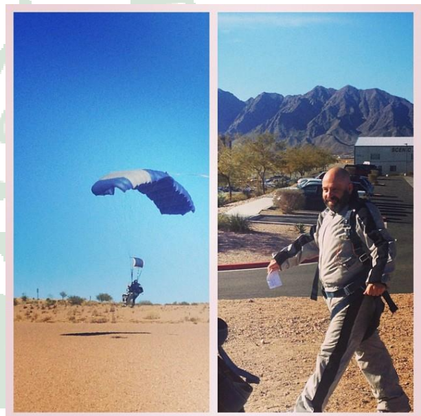
The landing! And the “I’m da Boss” Walk.

I want to thank all of you for your support. In addition to raising funds for our Fraternity (the point of the event), you guys helped provide me with yet another amazing life experience! Although it seems SAVE pulled ahead on Friday, it was too late to cancel the reservation... So I took the plunge. The save energy worked. I'm still here!