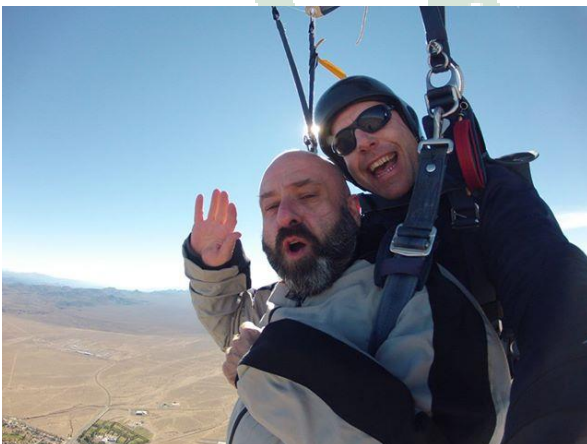
On the way down. No sweat!